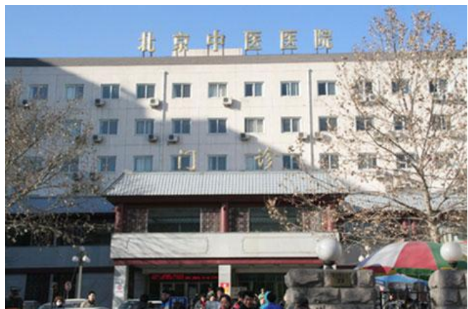
A hospital in Beijing

Four years ago, during a meeting with SESEC, a representative from the Ministry of Health expressed her belief that China's healthcare standardization development had not yet attained sufficient maturity to allow fruitful cooperation on technical issues with Europe. As China's healthcare standardization entities have developed and as China is about to step into active standardization of e-health, it appears that the time is now ripe for collaboration.