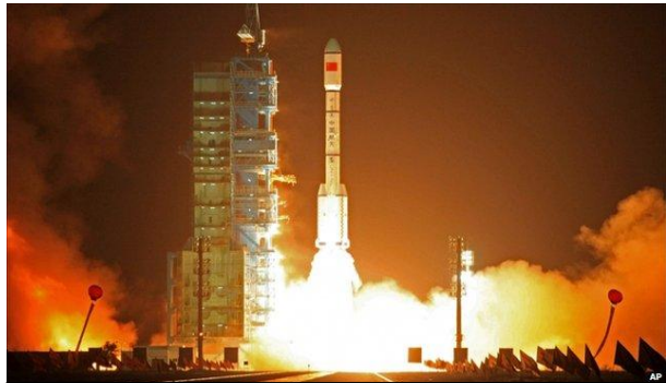
The launch of Tiangong-1 on September 29 th

29 th September 2011, the unmanned spacecraft Tiangong-1 blasted off from the Jiuquan Satellite Launch Centre in the Gansu province of China. Tiangong-1 (Heavenly Palace 1) is China's first space laboratory module and is designed to support and trial space docking capacities.